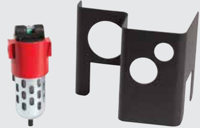
Air filtration kit