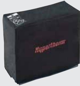
System dust cover